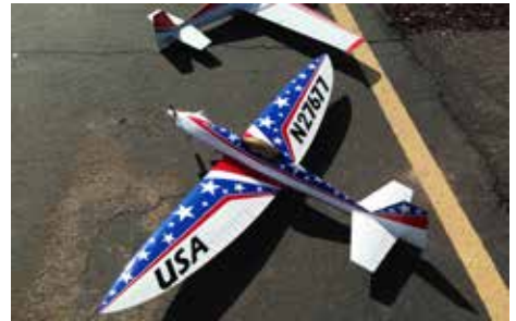
Some of the competition