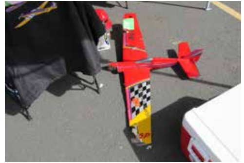
There were a few of these