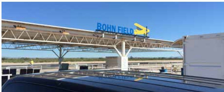
The field in Florence even has a solar powered charging station

DUES ARE $75 IF PAID BEFORE JAN 1ST, $100 THEREAFTER.