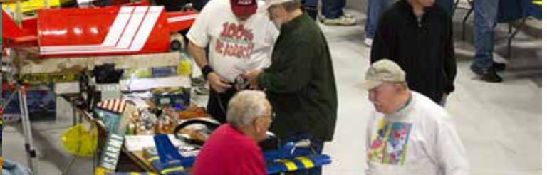
All pictures are from the 2015 swap meet