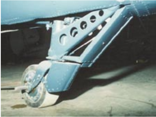
THE REAL THING