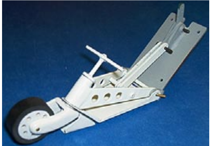
PAPPY'S SCALE RETRACT

In this first installment I'll just show the tools and materials needed, I don't want to take up too much newsletter space as there are lots of pictures. If anyone wants I'll have an electronic version of the whole article also. Send me an e-mail.