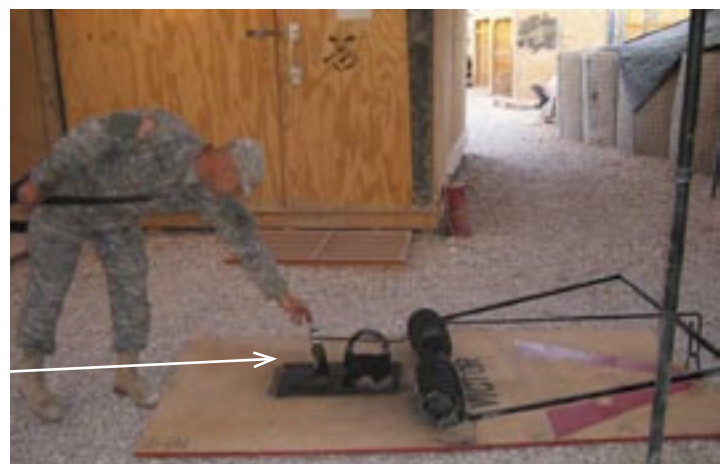
THAT'S A BEER BOTTLE

DIABOLICAL TERRORISTS DEVISE NEW TRAP FOR OUR GI'S