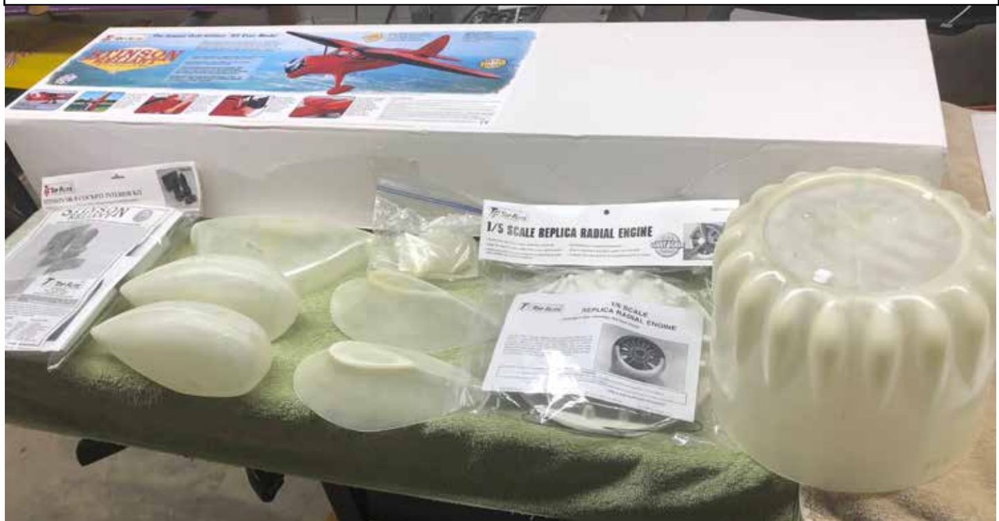
Top Flite Stinson Reliant with Fiberglass specialty parts

I wasn't planning on another scale airplane for winter build next year but this one was given to me by a friend who had it given to him and I couldn't resist the challenge.