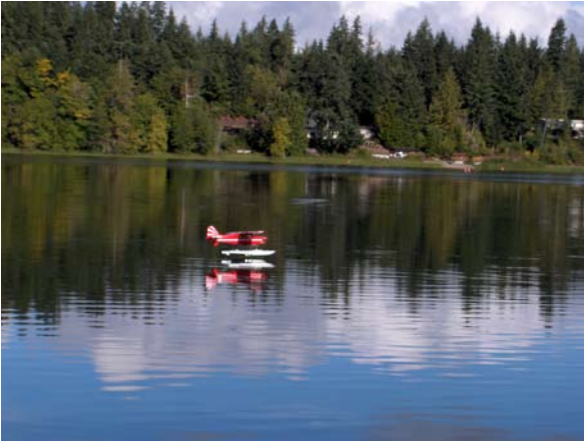
Look at that water!