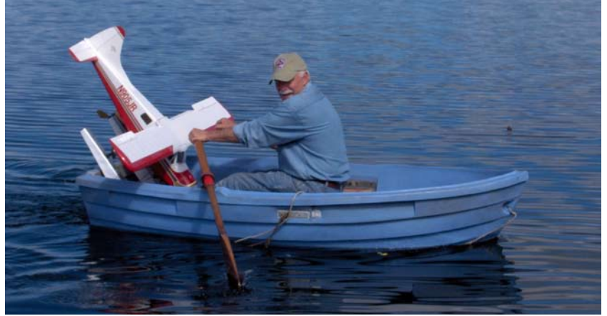
Who is that hiding behind the bill of his hat