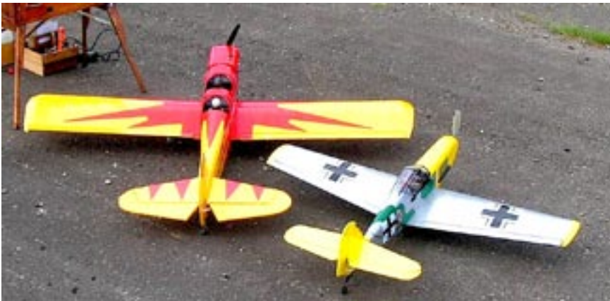
GORDY OSBERG'S PLANES

We finally got some GOOD weather for a scheduled event and a pretty good turn-out too considering the number of other events going on that week-end. Thanks to everyone who helped out and to everyone who brought their favorite side dish or dessert, there was a great spread. All in all it was a good day.