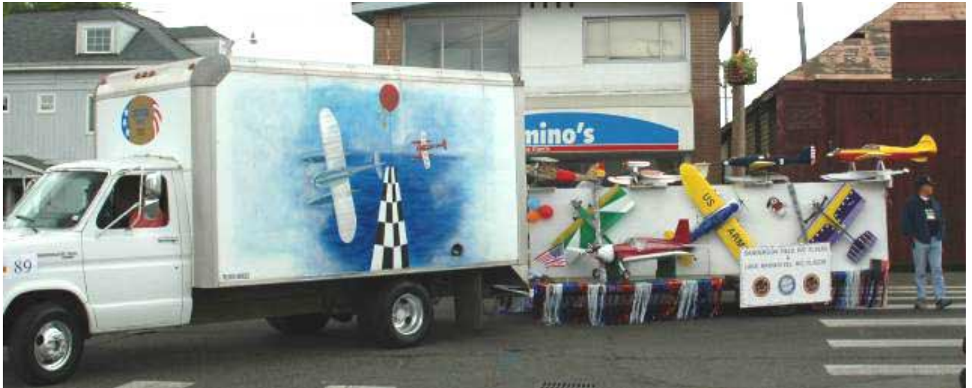
NICE JOB ON THE FLOAT