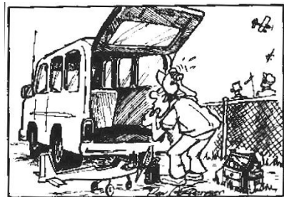
LET'S SEE. FIELD BOX... CHECK. RADIO... CHECK. FUSELAGE... CHECK. WINGS... WINGS!!!? WING!

"I WON'T BE COMING INTO THE OFFICE TODAY. I'LL BE OUT IN THE FIELD DOING RESEARCH."