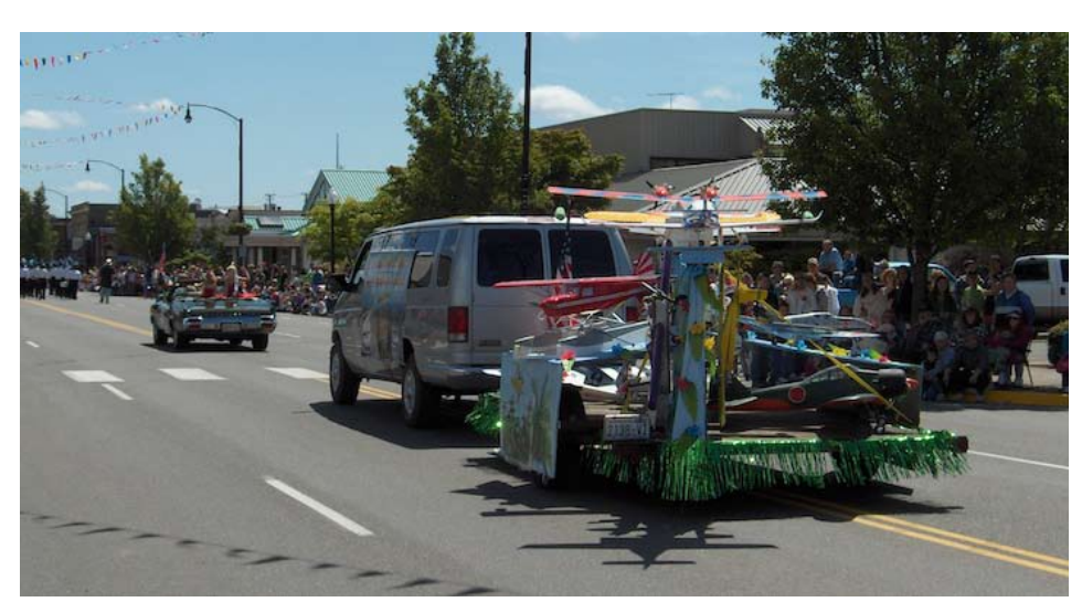
Forest Festival parade float (3rd place novelty class)