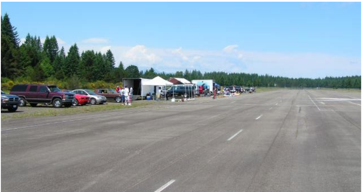
WE HAD A GREAT TURN OUT FOR OUR PUBLIC DAY AND GREAT WEATHER TOO!

CHUCK KENTFIELD 3122 Madrona Beach Rd Olympia WA 98502