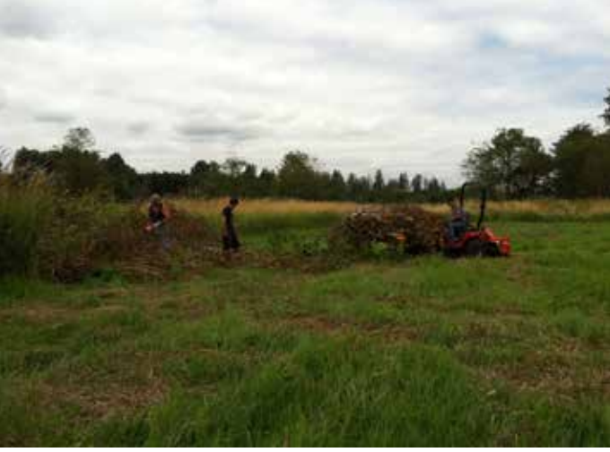
and the trees