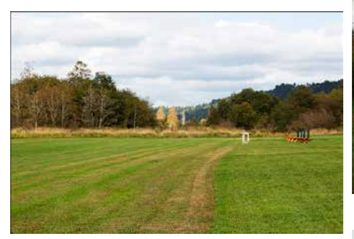
Clearing the Hay