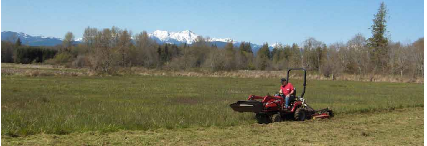
The new spot is pretty scenic.