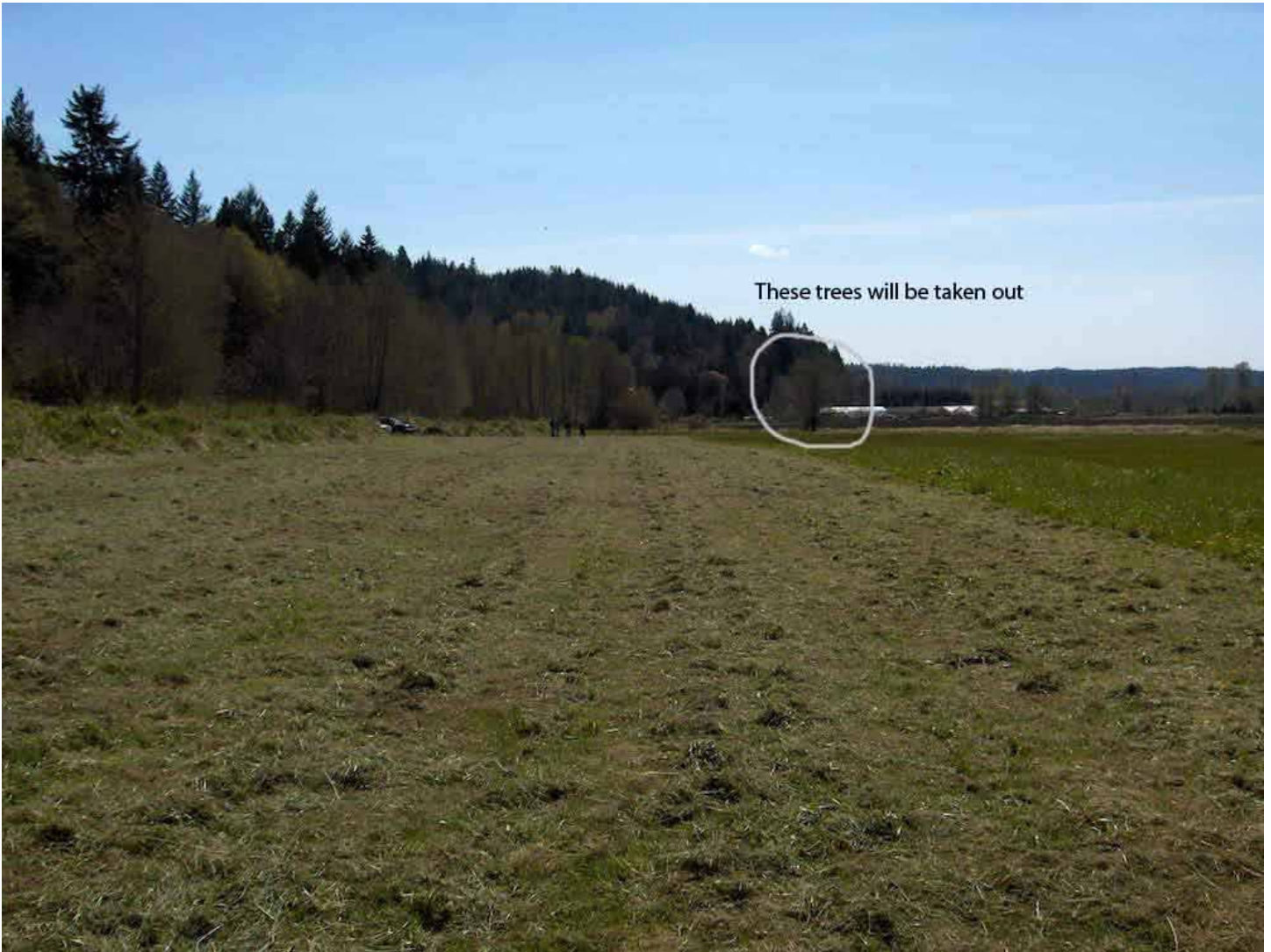
The runway will most likely start where the mowing stopped and the parking and pit area will be in the mowed area.