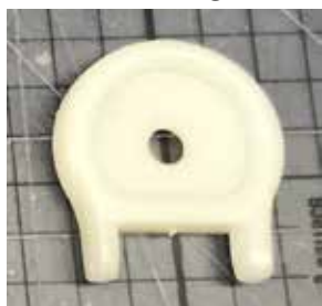
Dubro makes this one