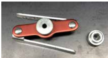
Robart drill guide

If you use Robart hinge points, Robart also makes a drill guide which makes the job a lot easier.