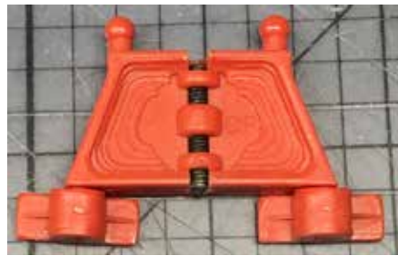
Great planes makes this one

The other day while looking for something else, I came across a drawing that someone made of a home made tool for marking the centerline for hinges which works on the same principle as the commercially available ones.