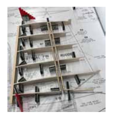
I do love my magnetic building board.