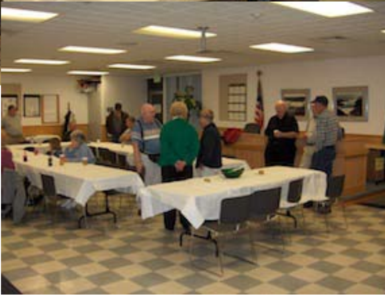
Socializing before dinner

This year we had great food as usual, no weather issues and a good time was had by all. We played “the game” this year instead of reading about the Wrights. We may have to go back to the story as we don’t have any “thiefs”. Well we had one but the guys just didn’t get into it. The girls had a lot of fun with it though.