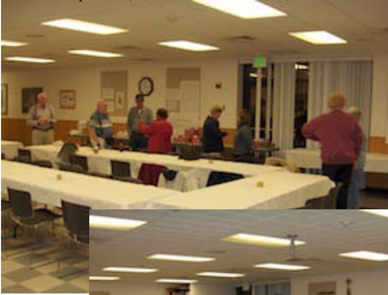
The setup crew (more not shown, thanks)