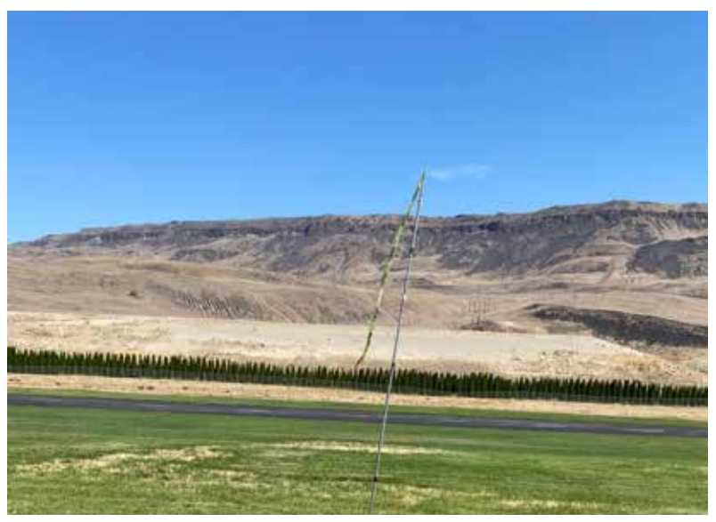
look at that. NO wind!