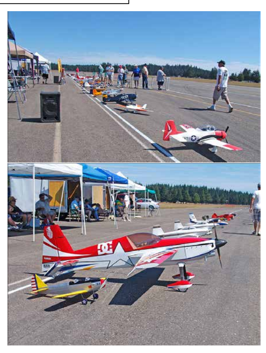
2014 Fun Scale fly-in line up for pilots choice award