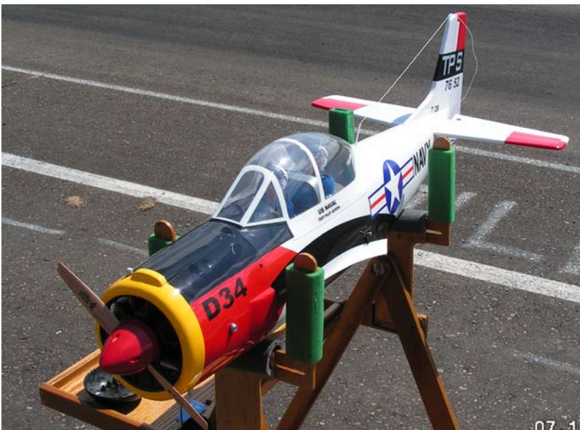
This 60 size T-28 ARF from Black Horse Models (available through Hobby People) brought by John Bowcutt is a very nice model. Better yet you can get it for $149 right now. It's nicely covered with Ora-cover with and the tandem pilots are factory installed.