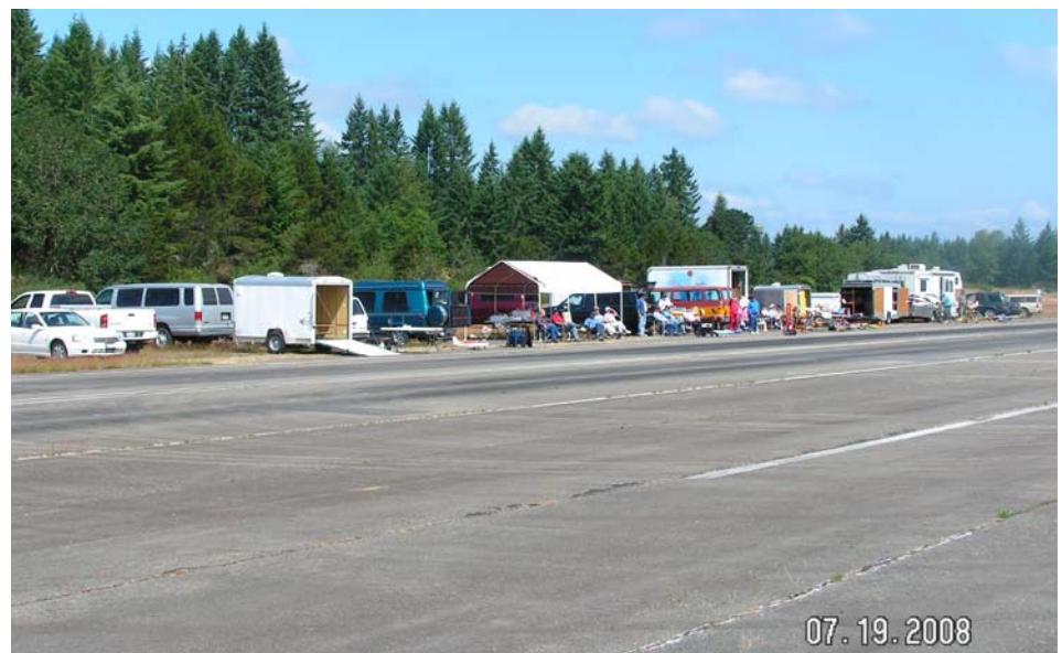
The scale fly-In had a good turn out this year. See page 2 for more pics.