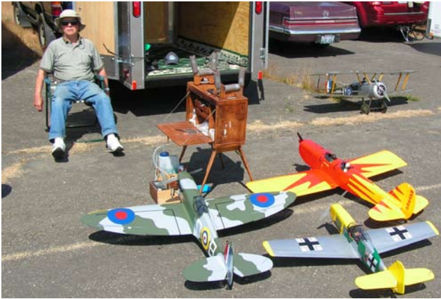
Gordon Osberg brought a nice collection of Scale planes.