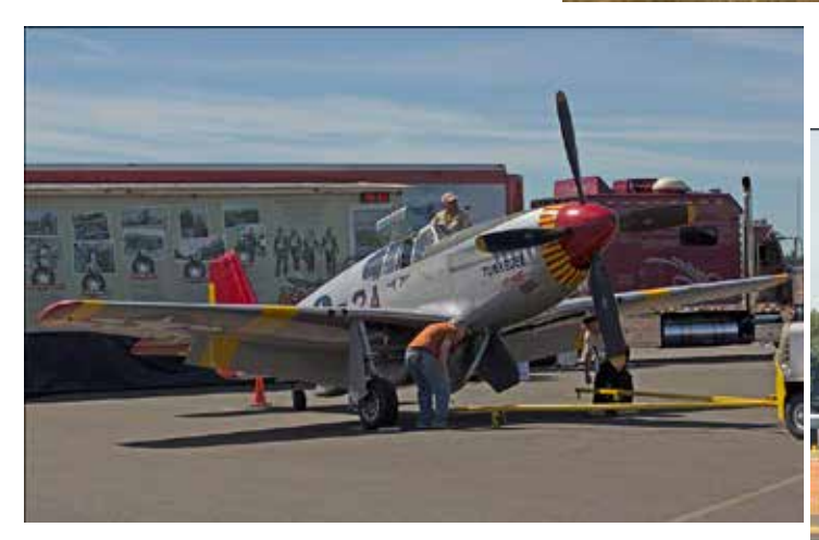
P-51 C Tuskegee Airmen plane