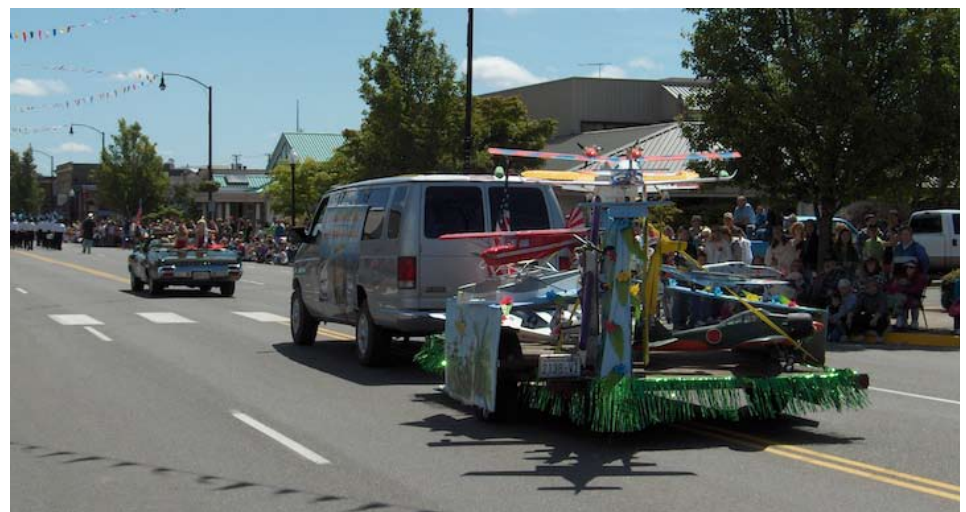
Forest Festival parade float (3rd place novelty class)