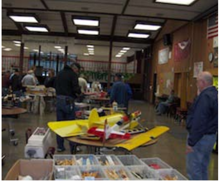
The 16th Annual swap meet went off with out a hitch although it was smaller than usual. Lots of good stuff exchanged hands.