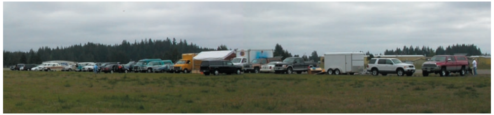
Cloudy, but a great turn out