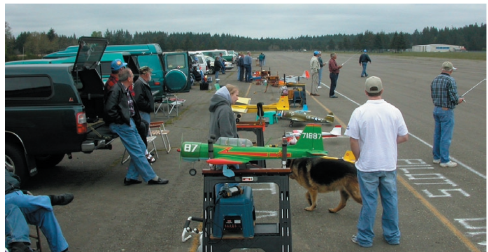
Looking down the Flight line