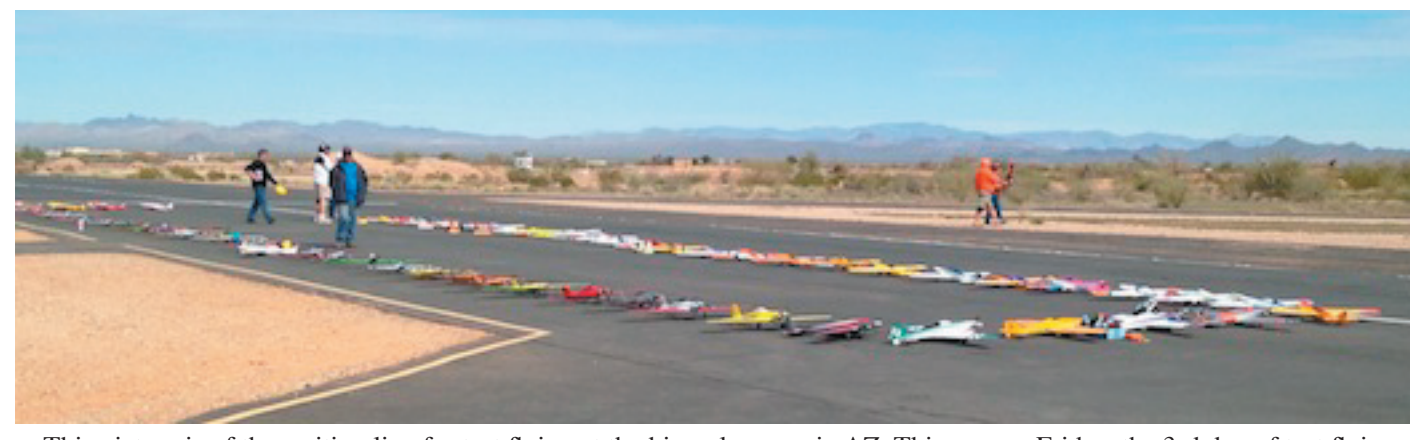
This picture is of the waiting line for test flying at the big pylon race in AZ. This was on Friday, the 3rd day of test flying.

I have since received an e-mail from the Forest Festival parade committee and the parade is going to be on Saturday May 31st.