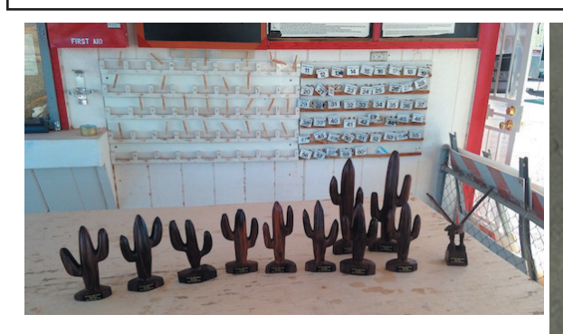
The Trophies, imagine that cactus in AZ