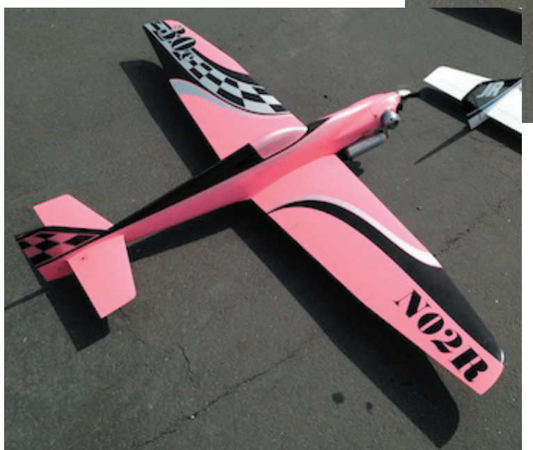
Just a few of the many planes at the race