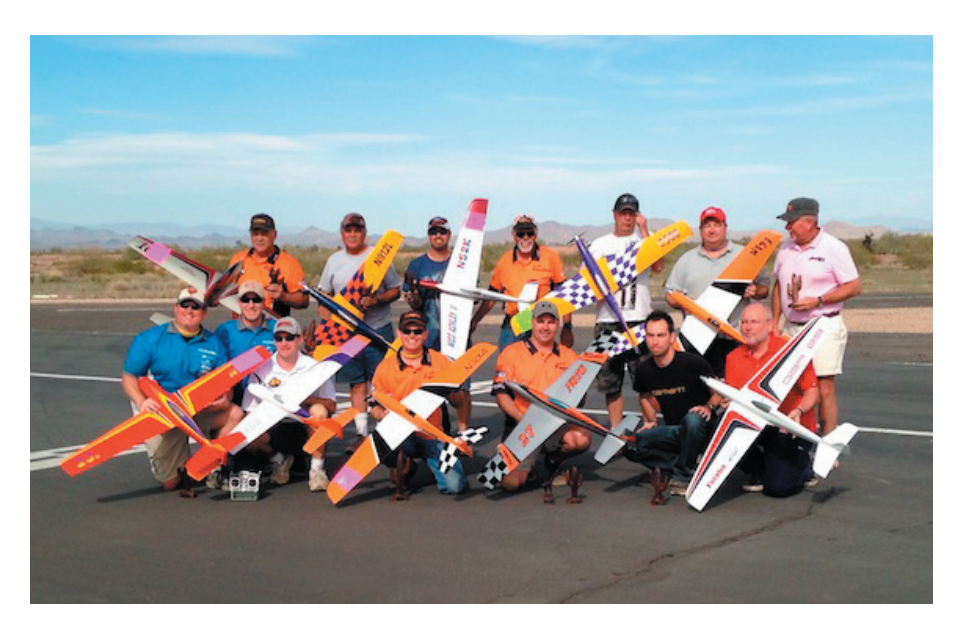
Top 10 plus fastest time

DEE GROUT P.O. Box 516 Union WA 98592 Make checks payable to SFRCF