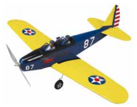
EFlite PT-19 450 ARF Brand New in Box Horizon Hobby Price - Discontinued For Sale - $75