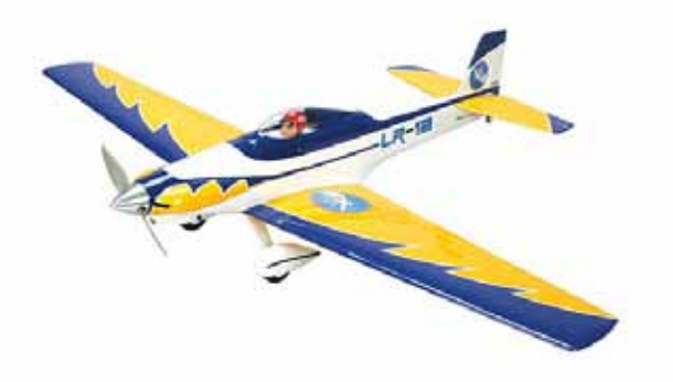
EFlite LR-1A Pogo 15e ARF Brand New in Box (Includes Spare Hardware Set, Spare Wheel Pants, Spare Top Deck) Horizon Hobby Price - $140 For Sale - $100